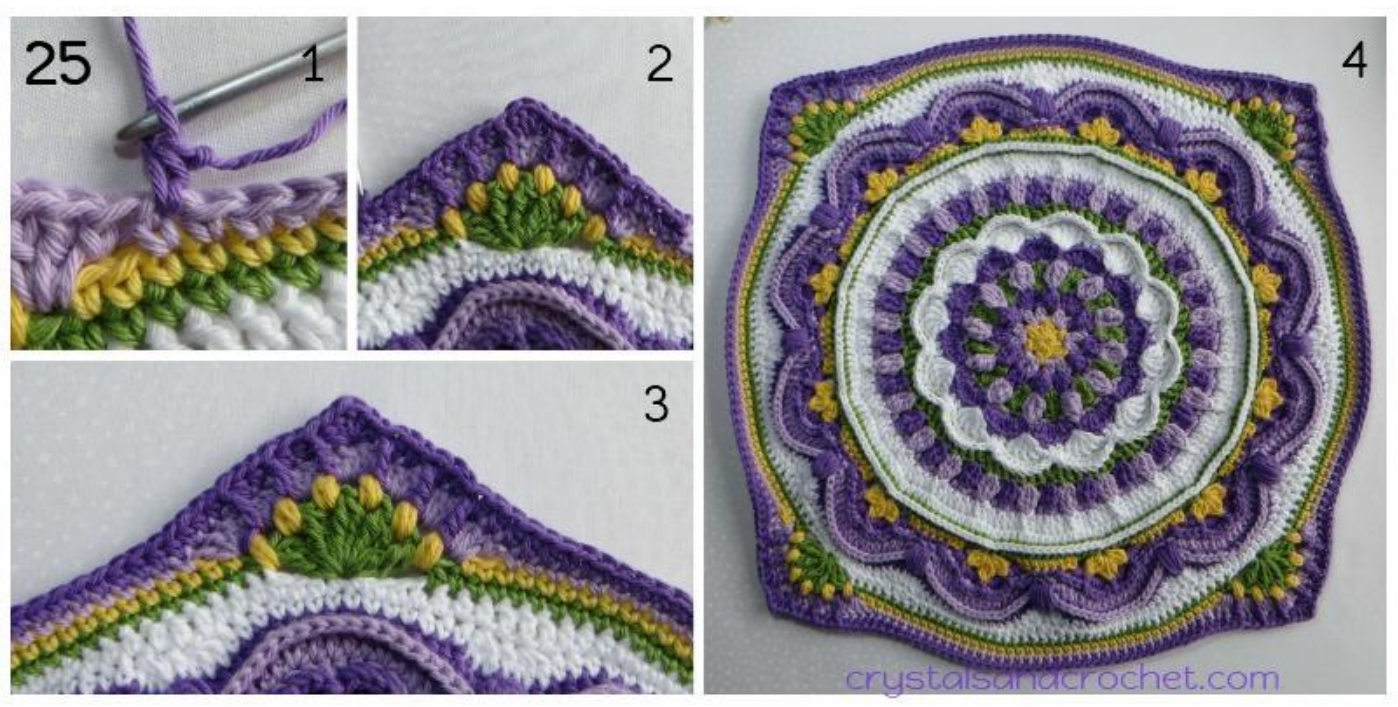
End part 2

25. Join with a standing hdc in last sc of any side [P1], hdc in next 3 sts, *(fptr around next mini puff st R23, skip next st, hdc in next 2 sts) twice, fptr around next mini puff st, skip next st, in next st (2 hdc, dc, 2 hdc) [forming corner], (skip next st, fptr around next mini puff st R23, hdc in next 2 sts) 3 times, [P2,3] hdc in next 5 sts, sc in next 30 sts, hdc in next 7 sts. *[P4] Repeat from * to * 4 times, omit last 4 hdc. Join to standing hdc, fasten off, and secure ends. Stitch count: per side: 30 sc, 26 hdc, 6 fptr, 1 corner dc.