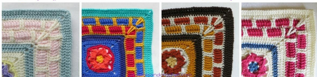
Colours per Round