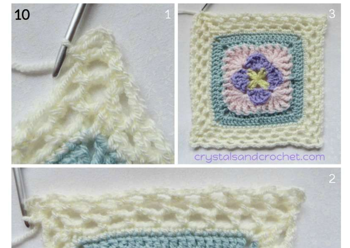
Stitch count: per side: 10 dc, 9 ch-3 spaces.