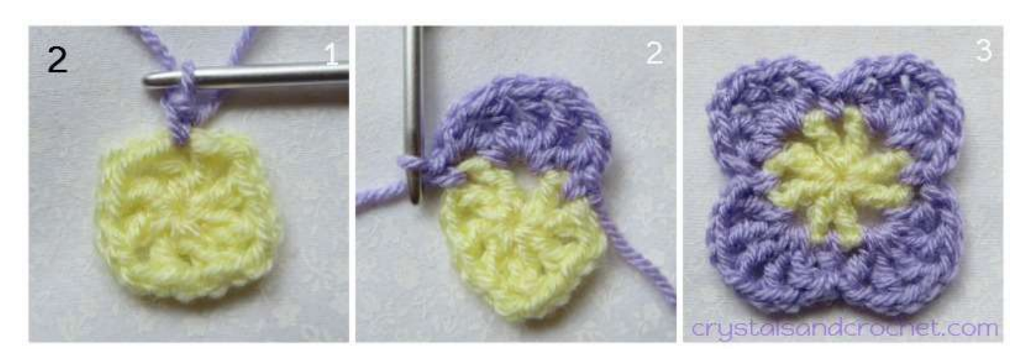
Hint: In this round you will work only in the 3^{rd} dtr of each shell and the dc between shells.

*skip next st, in next ch-2 space ((dtr, ch 1) 4 times, dtr), skip next st, dc in next ch-1 space. * [P2] Repeat from *to * 4 times, omit last dc. Join to standing dc, fasten off, and secure ends. Stitch count: 4 dc, 4 shells of 5 dtr plus 4 ch-1 spaces.