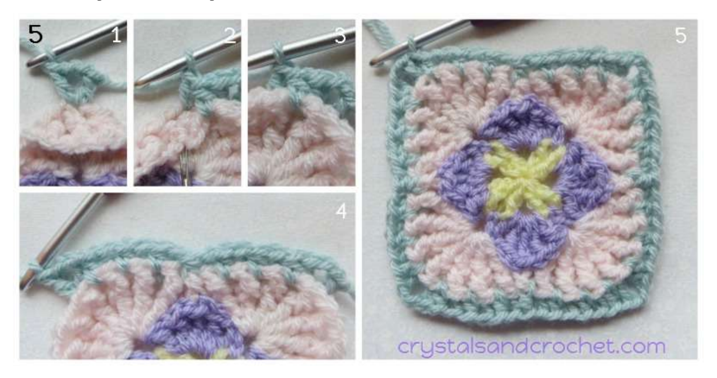
6. Ch 3 [counts as tr], [P1] *in ch-2 corner space (2 tr, ch 2, 2 tr) [P2], tr in next 15 sts [not forgetting the 1<sup>st</sup> hidden st]. * [P3] Repeat from * to * 4 times, omit last tr. Join to top of ch-3, fasten off and secure ends. Stitch count: per side: 19 tr.

Stitch count: per side: 6 htr, 1 fphtr, 8 tr.