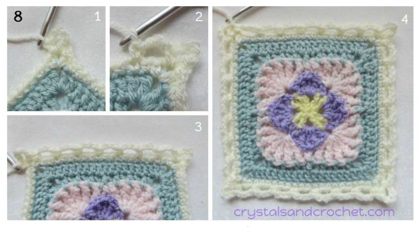
Original Design by Helen Shrimpton ♥ Copyright ° 2016 ♥ All Rights Reserved.

Stitch count: per side: 9 dc, 7 ch-3 spaces.