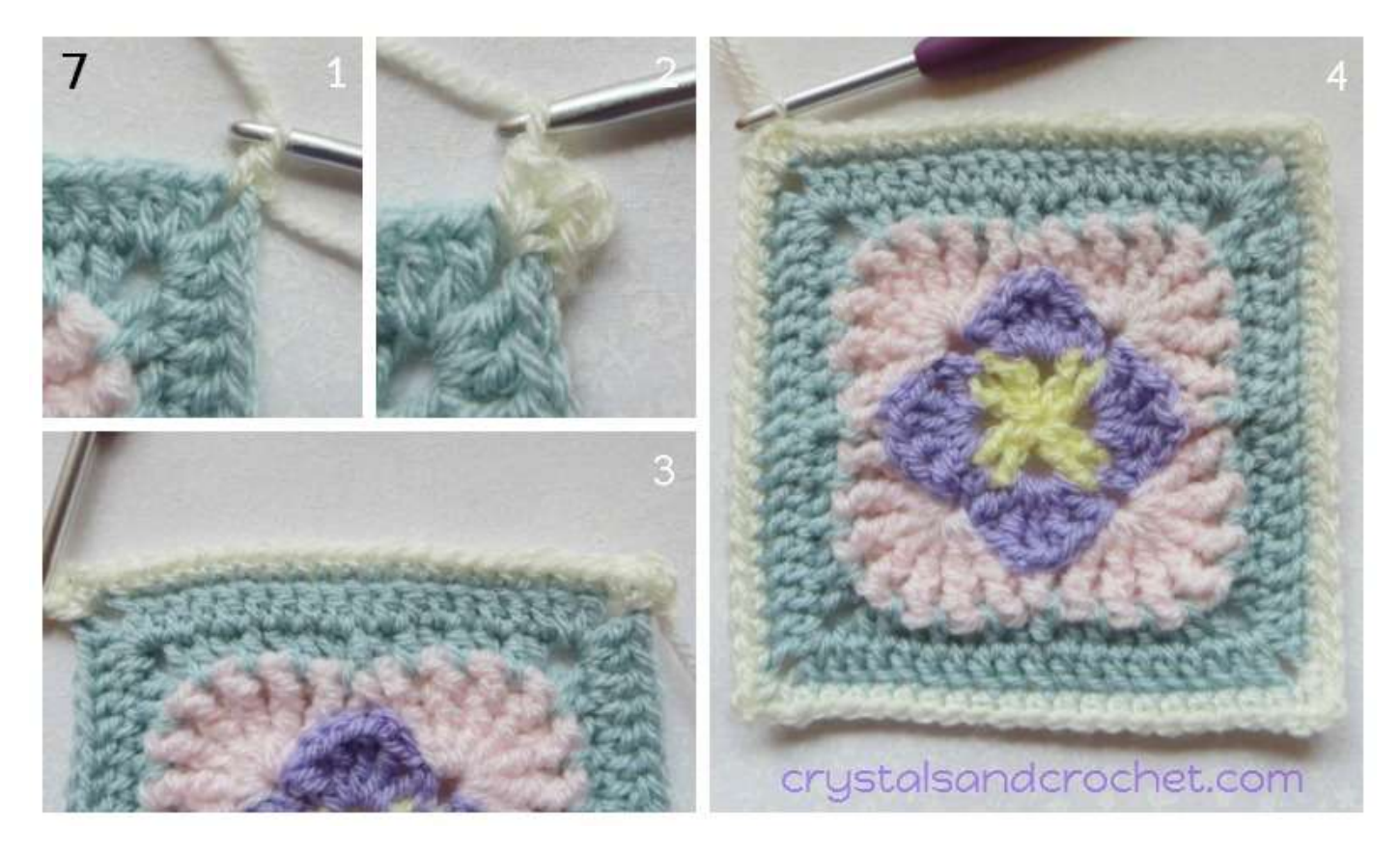
Hint: sides are not symmetrical, there is no ch-3 at the end of each side. 8. Sl-st into ch-2 corner space, ch 1 and dc, (ch 4, dc) in same space, [P1] *(ch 3, skip next 2 sts, dc in next st) 7 times [P2], in ch-2 corner space (dc, ch 4, dc). * [P3] Repeat from * to * 4 times, omit last corner group. Join to 1<sup>st</sup> dc with a sl-st.

Join to standing dc with a sl-st. Stitch count: per side: 21 dc.