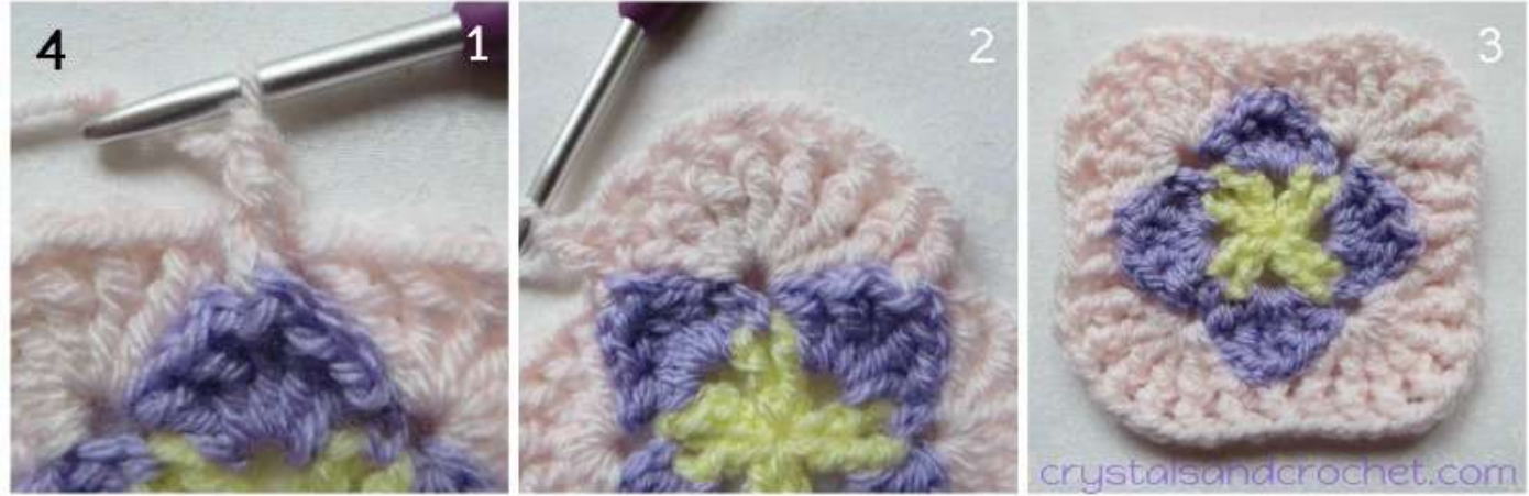
5. Join with a standing tr in 4<sup>th</sup> dtr R3 of any shell, (ch 2, tr) in same st, [P1] *(htr in next ch-1 space R4, tr in next st R3) 3 times, [P2,3] fphtr around next st R4 [ fptr made around dc ], (tr in next st R3, htr in next ch-1 space R4) 3 times, in next st R3 [4<sup>th</sup> dtr] (tr, ch 2, tr). * [P4] Repeat from * to * 4 times, omit last corner group. Join to standing tr with a sl-st.