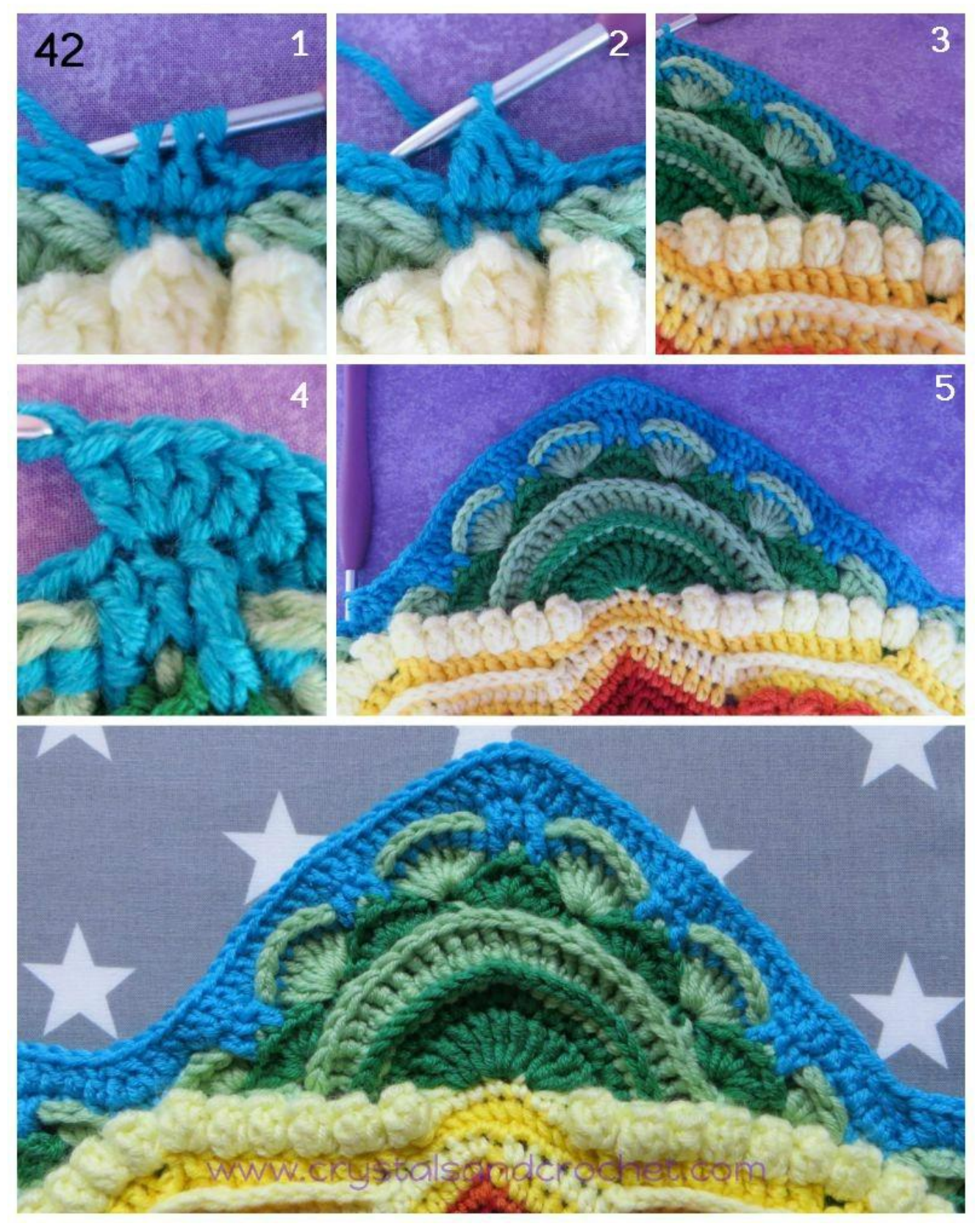
Original Design by Helen Shrimpton ♥ Copyright ° 2015 ♥ All Rights Reserved.

Repeat from * to * 7 more times, omit last dc3tog. Join to starting dc3tog, fasten off, and secure ends. Stitch Count: Per repeat: 51 dc, 1 dc3tog. Total: 408 dc, 8 dc3tog.