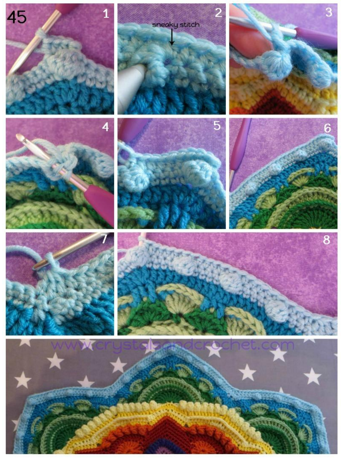
Original Design by Helen Shrimpton ♥ Copyright ° 2015 ♥ All Rights Reserved.